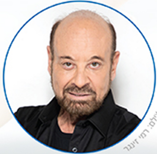
פרופ' רפי קרסו

רופא/ה יקר/ה, למידע נוסף, יש לפנות לעלון לרופא ועלון לצרכן באתר משרד הבריאות בלינק הבא