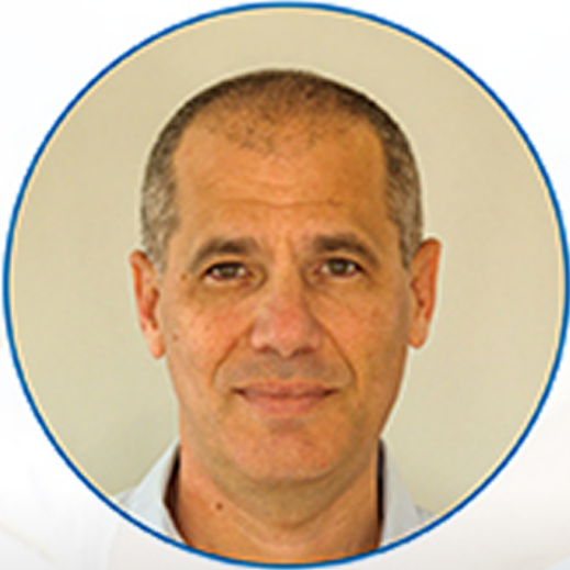
פרופ' אילון בן-צבי